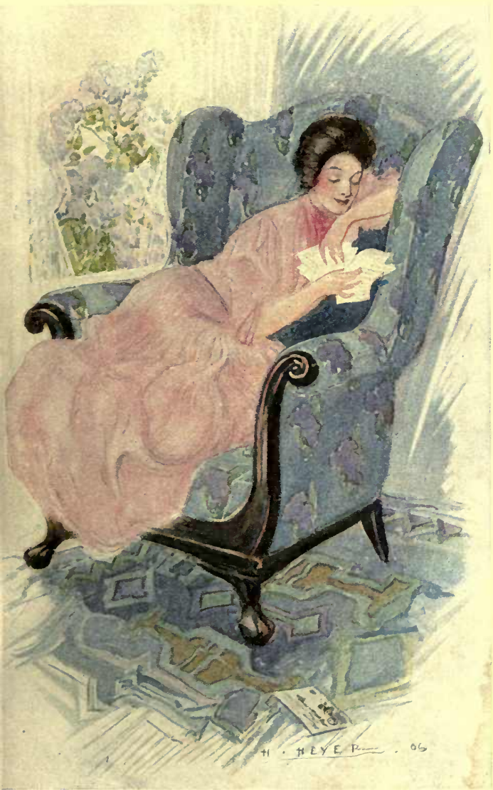
She tore open the envelope and found many sheets of thin paper. (Page 122)